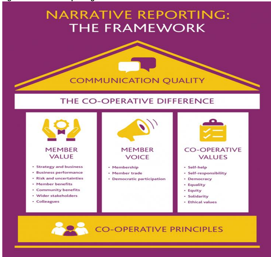
Figure 2: Narrative Reporting: The Framework

Another example of a co-operative reporting framework is the Co-operative Performance Indicators (CPI) project led by the Centre of Excellence in Accounting and Reporting for Co-operatives, based at Saint Mary's University, Nova Scotia, Canada. The CPI is currently in the pilot phase and its focus is to develop a series of measures that reflect the seven principle of co-operatives. The ultimate aim of the CPI is to develop benchmark data that will enable co-operatives to compare and evaluate their performance (<a href="https://www.smu.ca/academics/sobey/co-operative-performance-indicators.html">https://www.smu.ca/academics/sobey/co-operative-performance-indicators.html</a>).